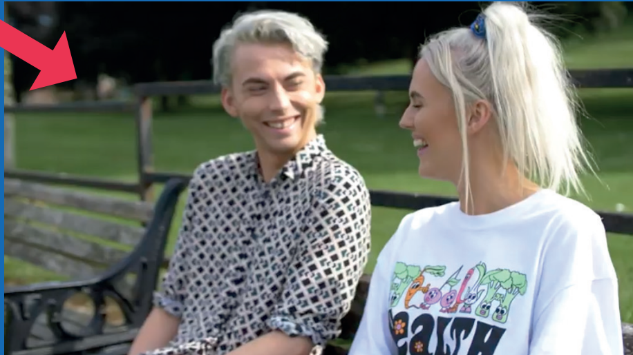
Still from 'Network of Artists' Spotlight film

Follow @CreativeSpaces on Instagram to get the low down on what's been happening